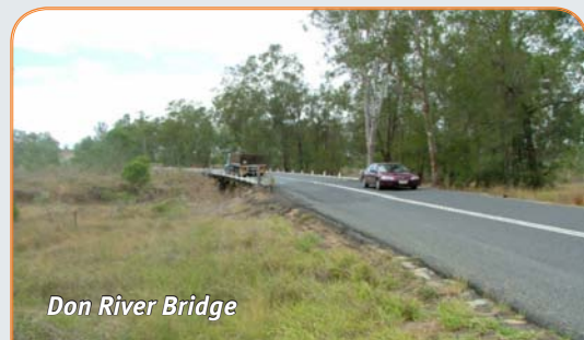
Don River Bridge

Planning, investigations and preliminary design will continue over the next three months, with construction expected to commence mid 2010. The realignment and upgrade of the Leichhardt Highway is scheduled for completion in late 2011.