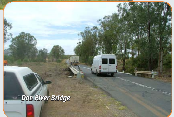
Don River Bridge