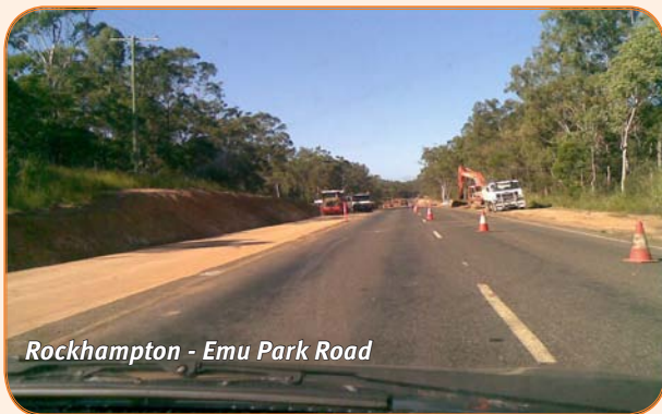
Rockhampton - Emu Park Road

The upgraded Emu Park Road is on track to be opened to traffic in June 2010.