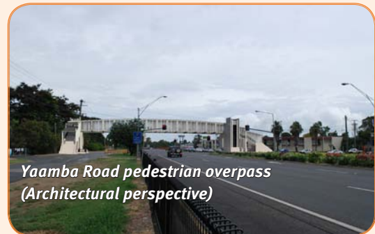
Yaamba Road pedestrian overpass (Architectural perspective)

Once completed, the Yaamba Road pedestrian overpass will provide safe pedestrian access across the busy North Rockhampton corridor and reduce delays for traffic on Yaamba Road.